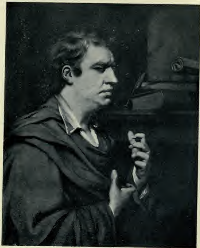
SAMUEL JOHNSON, LL.D.

After the Painting by Sir Joshua Reynolds, P.R.A.